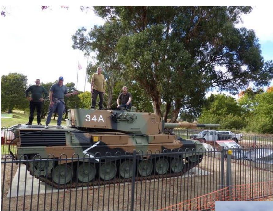
2021 at Beaconsfield RSL Park, Tasmania the original crew