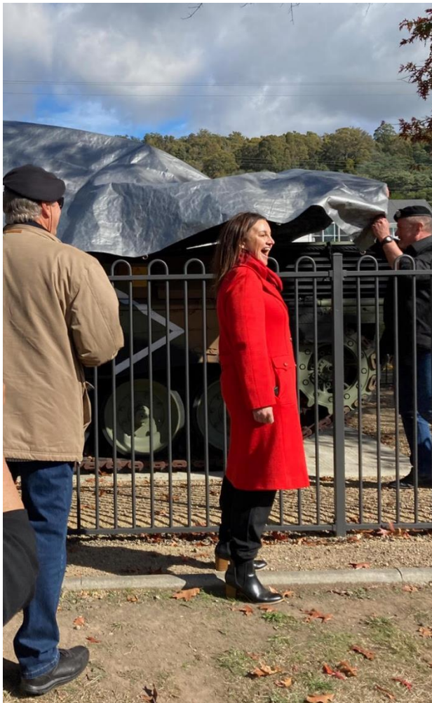
A job well done, 27742 now complete with her new paint job and tac signs and name "Copus Carious" = COP CAR as three of her last crew were serving Victoria Policemen.